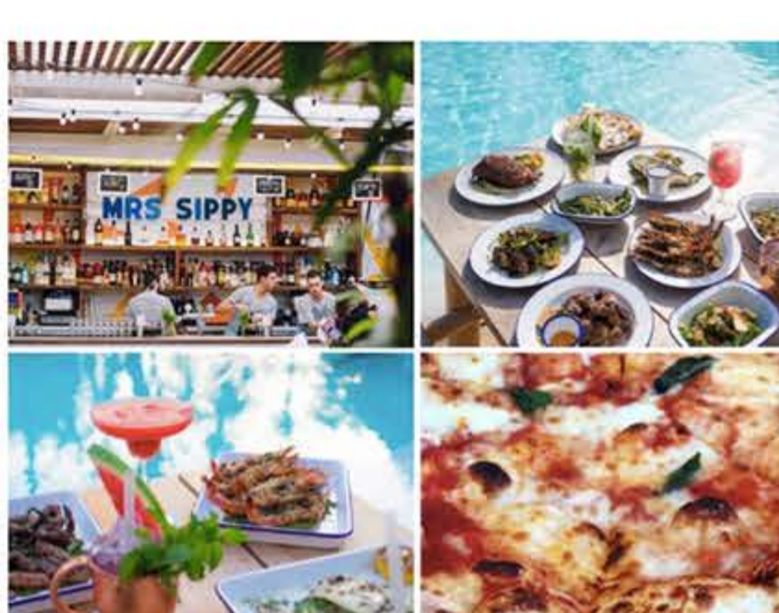
Pizzas, grills and cocktails feature on the all-day menus at Mrs Sipoy

Mrs Sipoy Mrs Sipoy launched into Seminyak with a splash, literally. The latest day club to open in Bali is built around a huge, turquoise pool with a two-tiered diving platform. Much of the action happens in and around the pool. It may be easy to overlook the food here, but don't. A large charcoal grill is turning out some mouth-watering, flame-kicked meat and seafood. Burritoshed prawns, octopus, ribs and steaks are served alongside salads that cross over from traditional, like the Greek and Caesar, to more adventurous like the charred cauliflower salad dressed with raisins, nuts and pecorino. The pizzas are my favourite and it is hard to go past the bubbling, cheesy, wood-fired numbers that come as plain as you like or pipered with spicy toppings. There are standards like the burgers, nachos and sandwiches alongside a melting butterfish tartare, fresh prawns and charcuterie. My tip is to get there early, they serve a pretty good breakfast, and stay for the day, in the afternoon, things start to heat up, especially on Thursday and Sunday when they party with discounted cocktails. It's a lot of fun and it can get a little hectic, which is when you want to step it up.