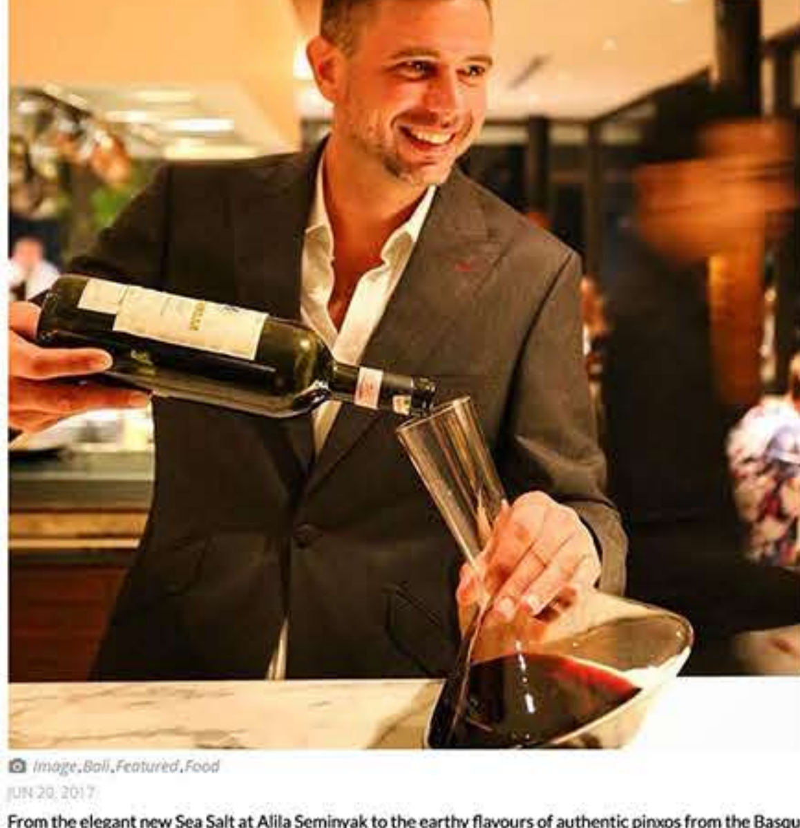
Image: Bali_Featured_Food JUN 20, 2017

From the elegant new Sea Salt at Alila Seminyak to the earthy flavours of authentic pinxos from the Basque country at Echo Beach, new flavours and classic recipes are spicing up the menus in Seminyak and Canggu. Balifood checks out new restaurants and new menus in our neighborhood.