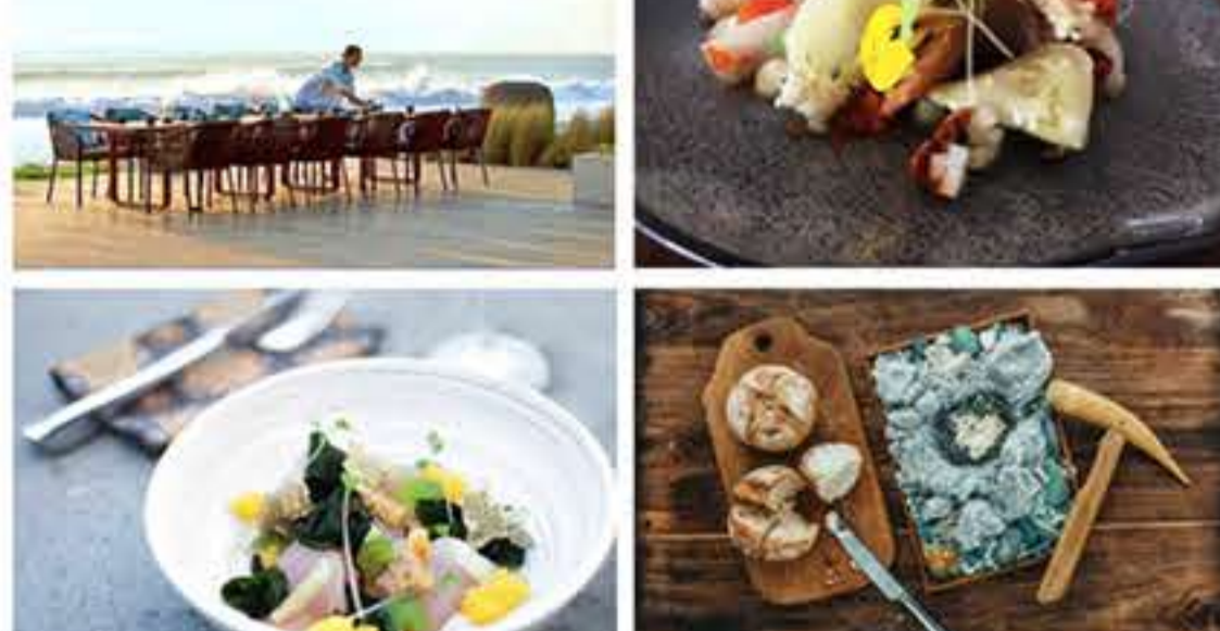
Plates and sea view at SeaSalt Seminyak

SeaSalt Taking inspiration from its stunning sea front location, SeaSalt restaurant recently launched at the Alila in Seminyak. A nod to the sea, salt and the ancient culinary traditions of Japan has revealed a menu that will keep everyone happy. Keeping their prices competitive means that SeaSalt can be enjoyed by everyone without the five-star price tag. This is a menu made for sharing with 4-5 dishes recommended per table, that's if you can hold back. A few musts on this menu includes the Seasalt salad with prawns, smoked butterfish, cured bonito, crab, tuna and kalamansi dressing; vegetarian dishes full of Japanese umami: deeply delicious mixed mushrooms and a Kyoto hummous, full-flavoured butterfish, roasted with a miso and honey dressing, resting on top of a stunning carrot puree with house-made pickles to sharpen the creaminess of the fish; and blue swimmer crab chawanmushi, a savoury custard that delivers big time on flavour. There's plenty of variety for meat eaters and the Sunday brunch is about to be re-launched with new packages aimed at families and those who like to settle in with cocktails or bubbles. There are few more beautiful places to spend a Sunday (or any day), by the sea, by the sea, enjoying a full day of sun, fun, cocktails, good food and finishing up with a glorious sunset. SeaSalt simply gives us another reason to hang out here.