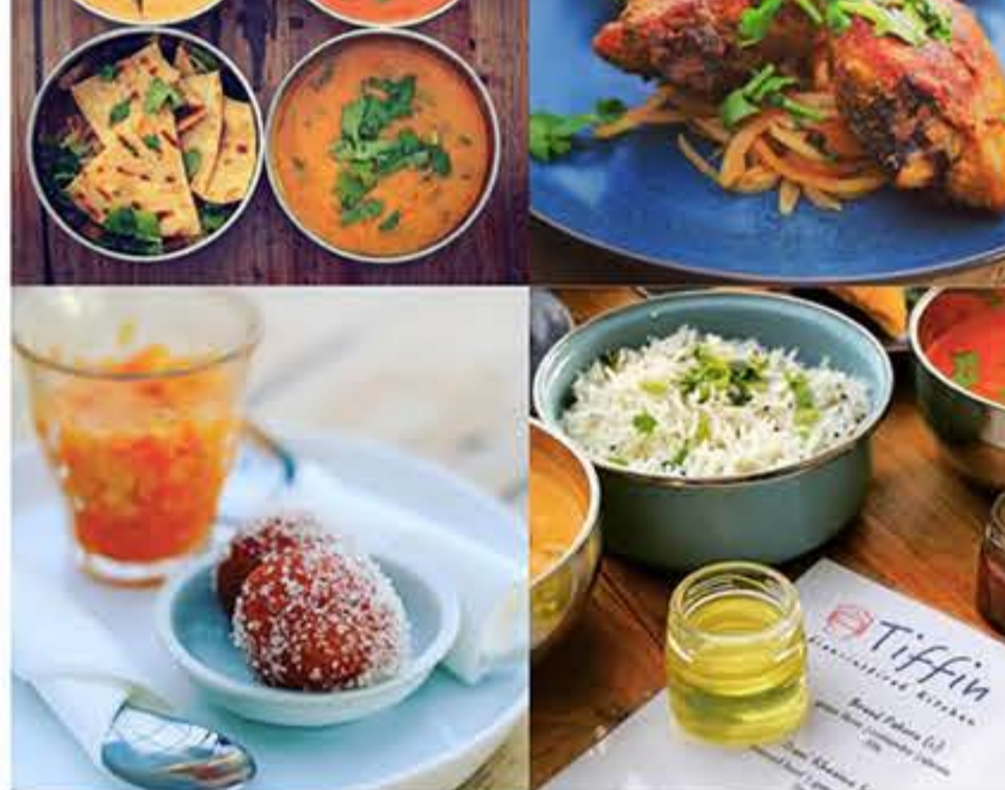
Savoury Indian food feature in small plates at Tiffin Bali

Tiffin Bali Indian food lovers will adore this little Indian street-side diner located in a row of small restaurants offering everything from Italian to Greek and Vietnamese, opposite Da Maria. The team behind it are five star all the way but Tiffin is rustic, affordable and authentic. Craving a dosa, an Indian-inspired breakfast, traditional street snacks, warm curries (some very warm!) and savoury meats and seafood, this is a must stop. Wash it down with some cold beers or a traditional lassi and head home with change. Upstairs the speakeasy-style Baker Street social (no signs required) is a great place to blow off steam and relax into the evening. They are opening earlier and offering canapés upstairs so you can still enjoy it AND get your beauty sleep.