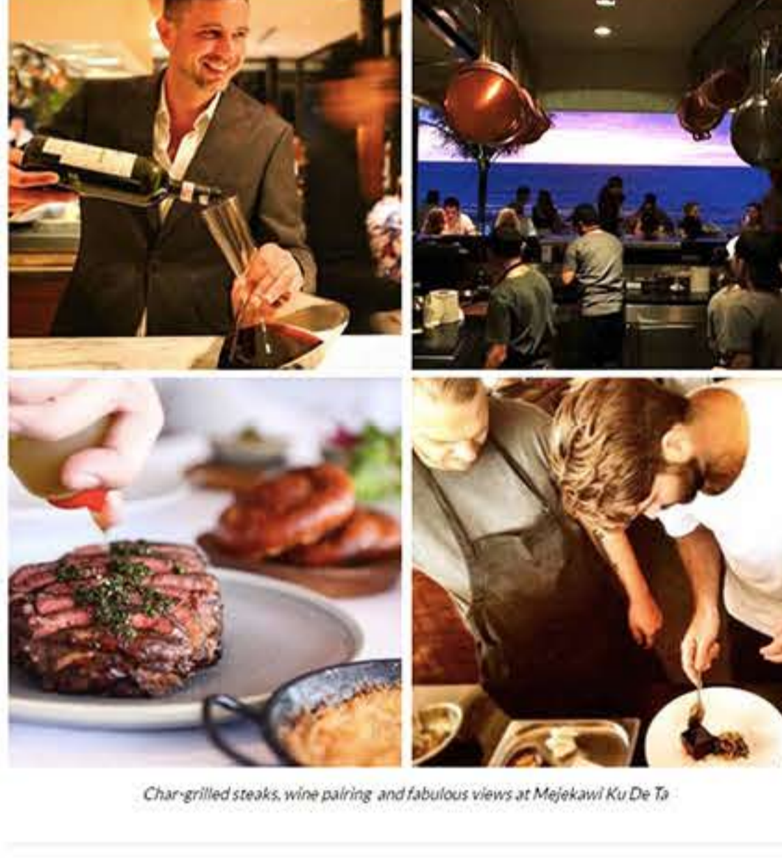
Char-grilled steaks, wine pairing and fabulous views at Mejekaui Ku De Ta

Mejekaui Mejekaui is about as special as it gets and now they are simplifying the menu to include diners who want leaner options to their celebrated degustation menu. And the new feature on this menu is steak, charred outside, perfectly pink inside, a choice of two different cuts is offered with a wine pairing option that elevates the humble steak dinner to new heights. Mejekaui is built around the open kitchen and watching the preparation is almost as distracting as the moonlit sea and the action downstairs as Ku De Ta entertains. With two wildly talented chefs running this show, the food is never less than wow and the new menus, and the rotating roster of visiting chefs from some of the region's best restaurants, makes Mejekaui a hit. PS: the degustation menus featuring five or eleven dishes are still on the menu and worthy of a celebration dinner you won't soon forget. Read more