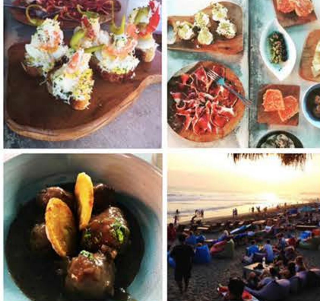
Delicious pinxos at Basque at Echo Beach

Basque at Echo Beach Echo Beach regulars usually head straight for the sea and the famous barbecue spread overlooking the surfers catching waves. There is now a great reason to enjoy the upstairs restaurant, and it is called Basque. Long time consulting chef, Asier, is a Basque native and the dishes on the menu here are as authentic as you'll find. We tried the traditional potatoes, creamy, spicy and more-ish, grilled chorizo with aioli, garlic prawns with a sauce that cried out for bread (and we got it), a plate of finely sliced Iberico ham with traditional tomato bread. We also feasted on traditional meatballs in a stick to your ribs wine sauce. This is the perfect accompaniment to a glass of great Spanish wine, which they have on the menu, or a few cold beers. Don't forget dessert either, including the traditional flan, a gooey berry cheesecake and a deep, dark curl of chocolate mousse served on a bed of berries. Basque is a great addition to the Canggu scene and an excellent reason to hang out in the renovated restaurant.