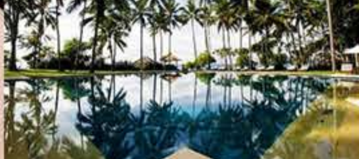
ALILA'S THREE FACES OF BALI