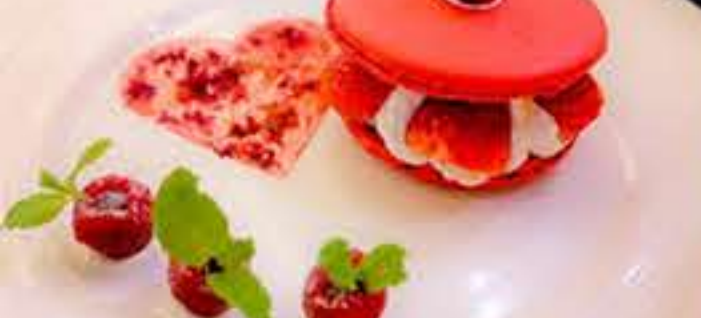
VALENTINE'S DAY AT MARINI'S ON 57