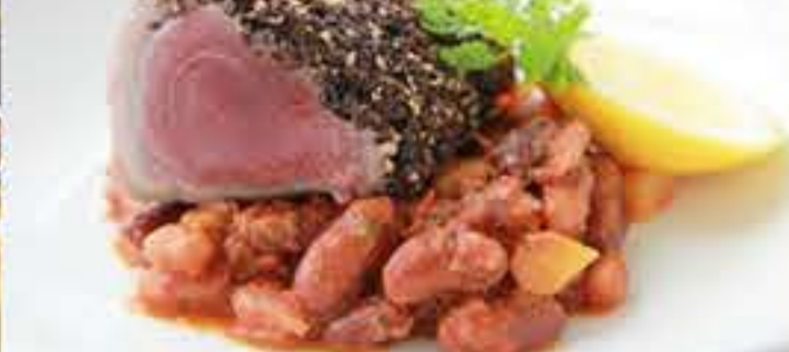
RESPONSIBLE SEAFOOD AT GRAND HYATT KL