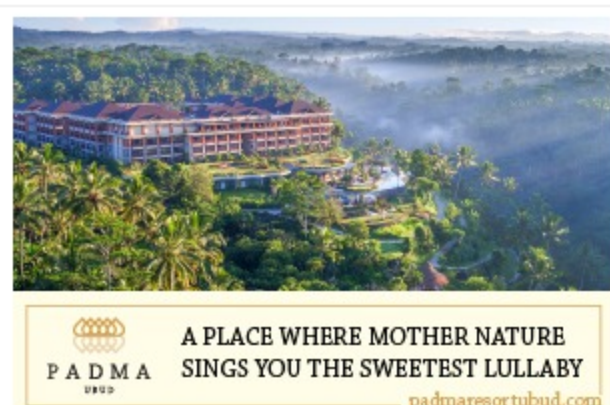
A PLACE WHERE MOTHER NATURE SINGS YOU THE SWEETEST LULLABY P A D M A www.padmaresortbud.com

New seafood restaurant Seasalt, located in the Seminyak area in Bali, recently opened its doors and offers authentic flavours from the ocean and the earth.