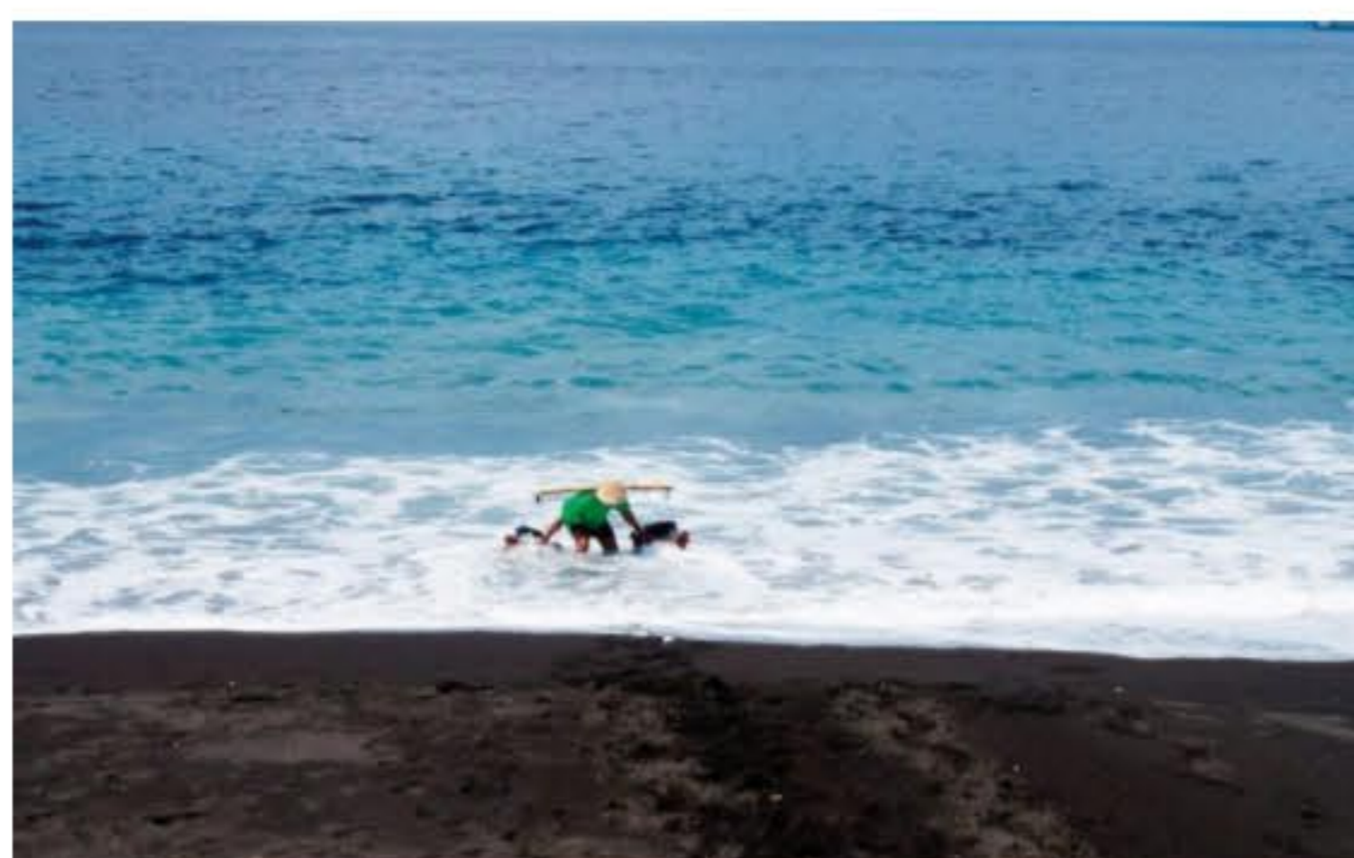
A heavy load to carry...

The small salt farm consists of flat terrain by the beach, where seawater, after being collected from the ocean, is left to evaporate leaving salt crystals behind, which are then collected in a series of wooden containers.