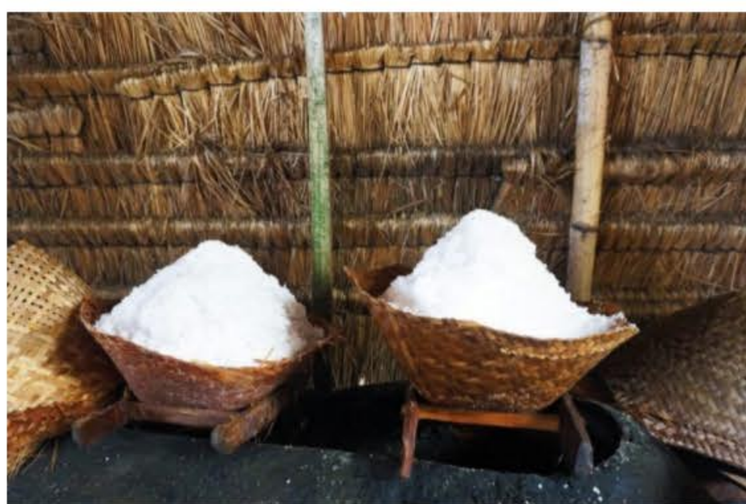
Bali's very own sea salt

You can find a small hut in the area, used by the workers to store the salt before being packed and sent to suppliers. Visitors to the salt farm can also purchase a bag of the sea salt for less than USD 5 - it should be enough for months of home supply.