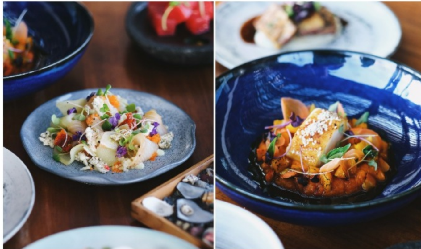
Let the munching marathon begin!

That's right fellow feasters, Seminyak's latest foodie destination has jumped on the gourmet brunching bandwagon and taken our Sunday munching rituals to delicious new heights. We're talking unlimited access to the smoked salmon station, bottomless buckets of prawns and succulent oysters – freshly shucked at your tableside, no less – and as many fresh-from-the-net plates from Seasalt's a la carte menu that your tummies can handle, like the Ceviche of the Day, seared mahi mahi and tuna tartare black rice crackers – yum!