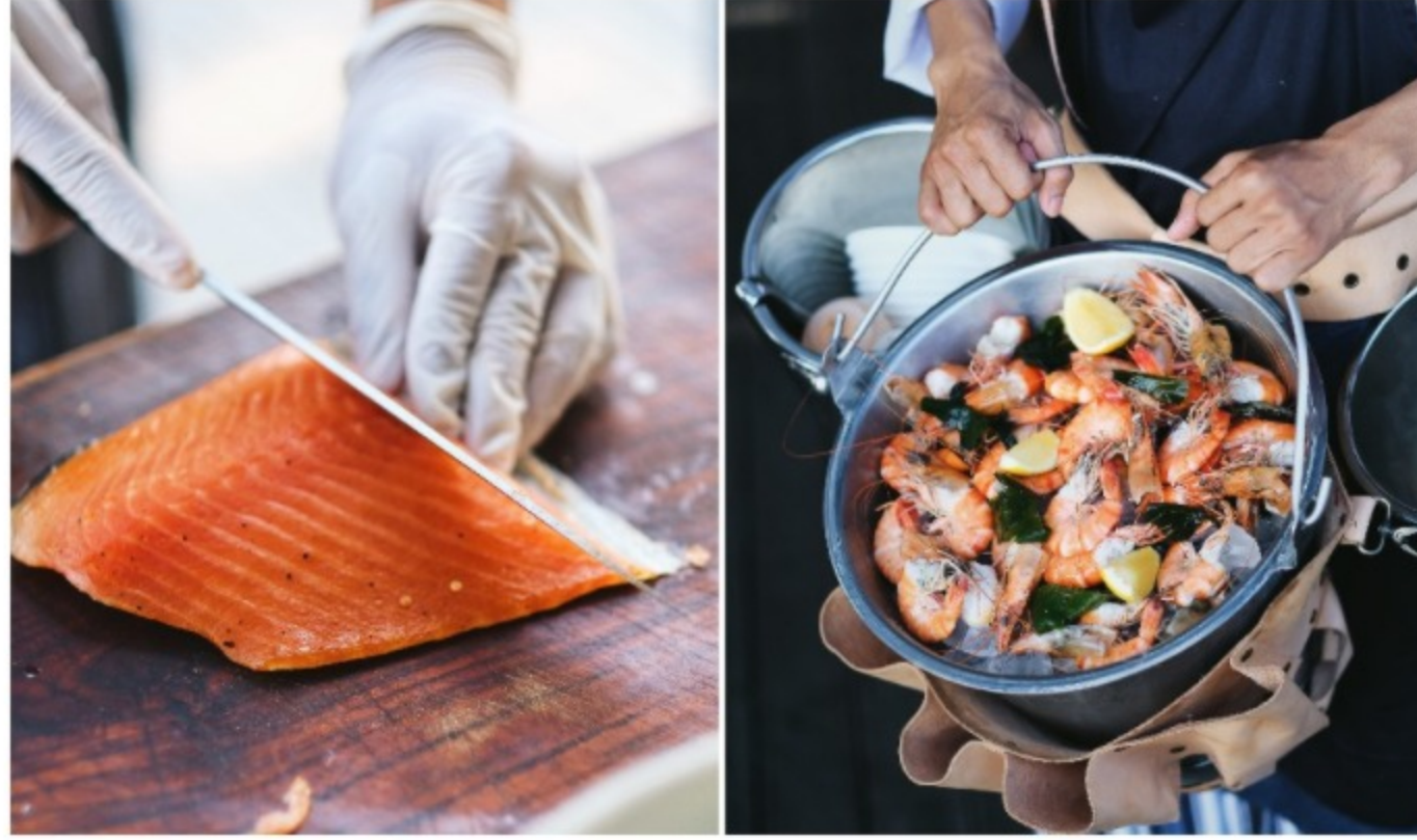
Sunday brunch, Seasalt style!

Fellow feasters, round up your foodie friends and steer your Sunday munching rituals to Seasalt in Seminyak for its brand new Coastal Munch brunch by the sea!