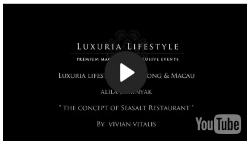
The Concept of Seasalt Restaurant by Chef Vivian

Authentic flavors fresh from the ocean and earth, beautiful ocean views, fresh ocean air... Seasalt epitomes the very best of coastal dining. A must-visit for foodies on holiday or living in the Seminyak area.