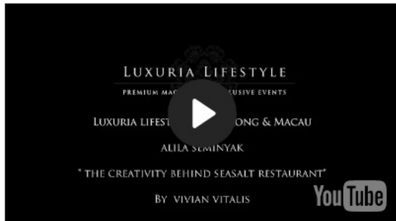
The Creativity Behind Seasalt Restaurant by Chef Vivian