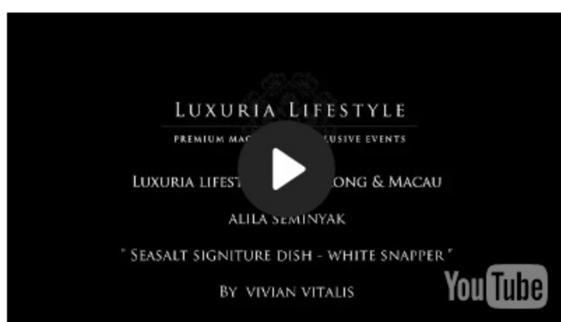
Seasalt Signature Dish – White Snapper by Chef Vivian