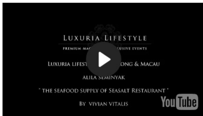
The Seafood Supply of Seasalt Restaurant by Chef Vivian